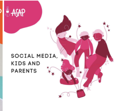
SOCIAL MEDIA, KIDS AND PARENTS