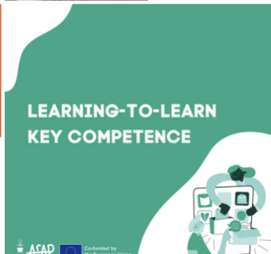
LEARNING-TO-LEARN KEY COMPETENCE